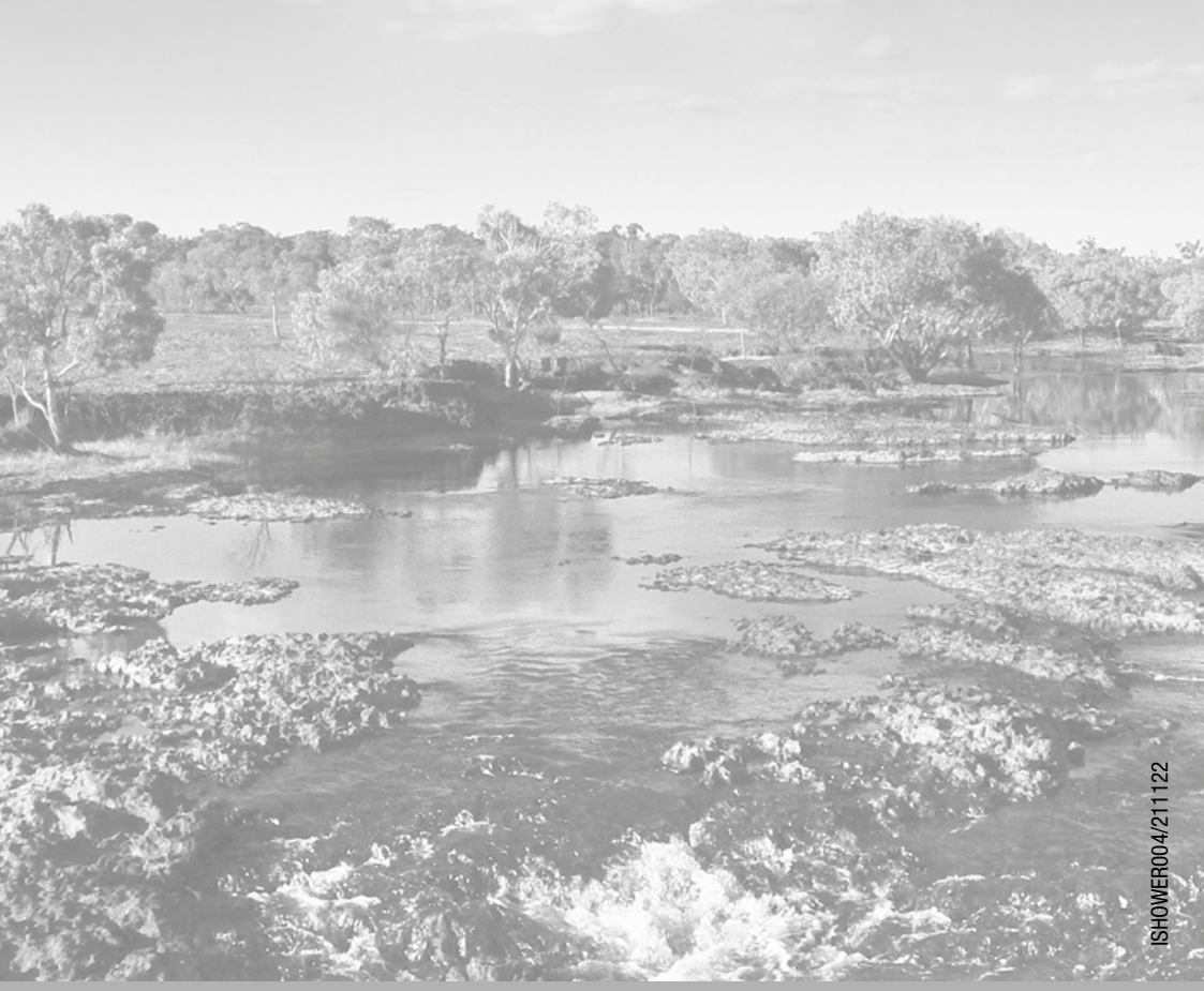
Page 4 of 4